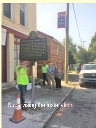
Supervising the installation.

A former small antique store is now the Main St. bar & grill, a farmer's market is held every week on the courthouse lawn & several buildings have been recently purchased that will be renovated. It's exciting for sure !