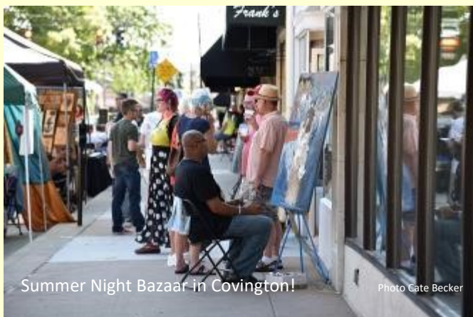
Summer Night Bazaar in Covington!

What was a vacant lot next to a building has been turned in to a seating area, outdoor garden, and play area for children.